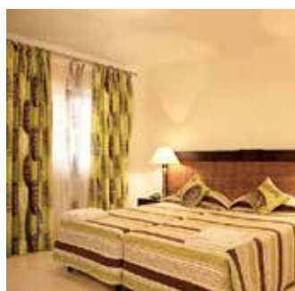
A twin standard bedroom

IELS school, bus stops, cafés, pubs and restaurants, pharmacy, banks, shops and supermarkets, rocky beach.