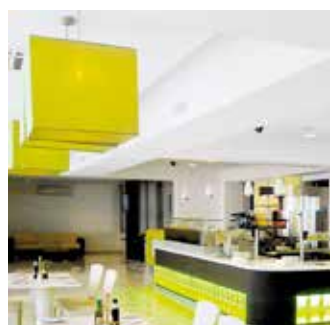
The hotel's restaurant