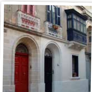
Traditional town house

2-hour ticket €2.00, 7-day ticket €21.00. For more details please visit www.publictransport.com.mt