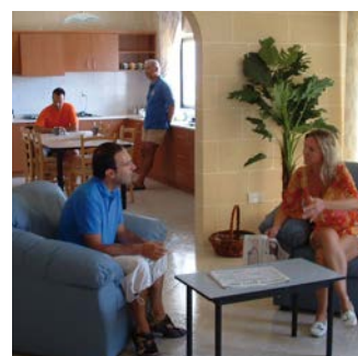
A living room